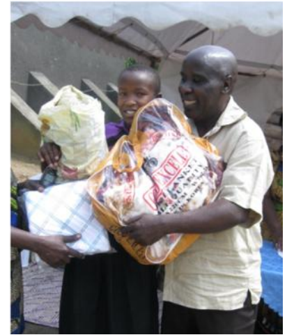
One of the kids swimming in God's blessings from a sponsor at the Christmas Distribution.

One of the grandmas showing off her Christmas cash gift. Her life and that of her grandchildren has changed forever because of her faithful sponsor.